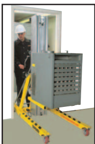
Fits through doorways!

Fast Action Stabilizer Legs Mounted on base top, stabilizer legs fold down with ease and lock in place. Optional on model 2112.